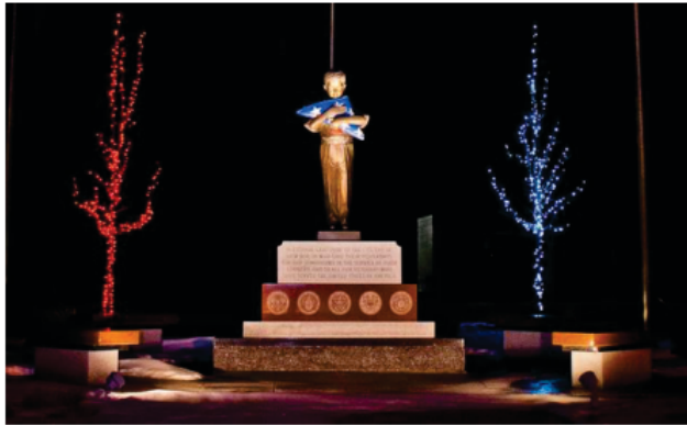
“Light the Lights” Ceremony

The New Berlin Veterans Memorial Society’s Board of Directors is pleased to invite all of you to our “Light the Lights” Ceremony. This event, sponsored by the New Berlin Lions Club, will take place at our beautiful Veterans Memorial located at the corner of National Ave. and Casper.